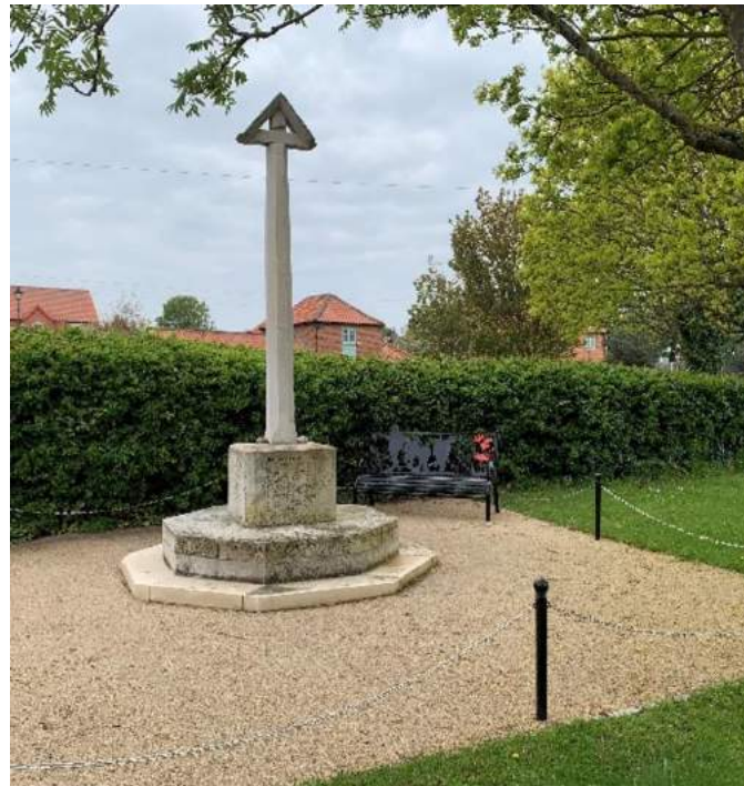
The War Memorial after its renovation & relocation

BHG also had a presence at the Local History Fair at Doncaster at Doncaster Museum in September 2023, which was organised by the Doncaster District Heritage Association. This January the group also made its first presentation outside of the town. This was at the invitation of Misson & Springs WI.