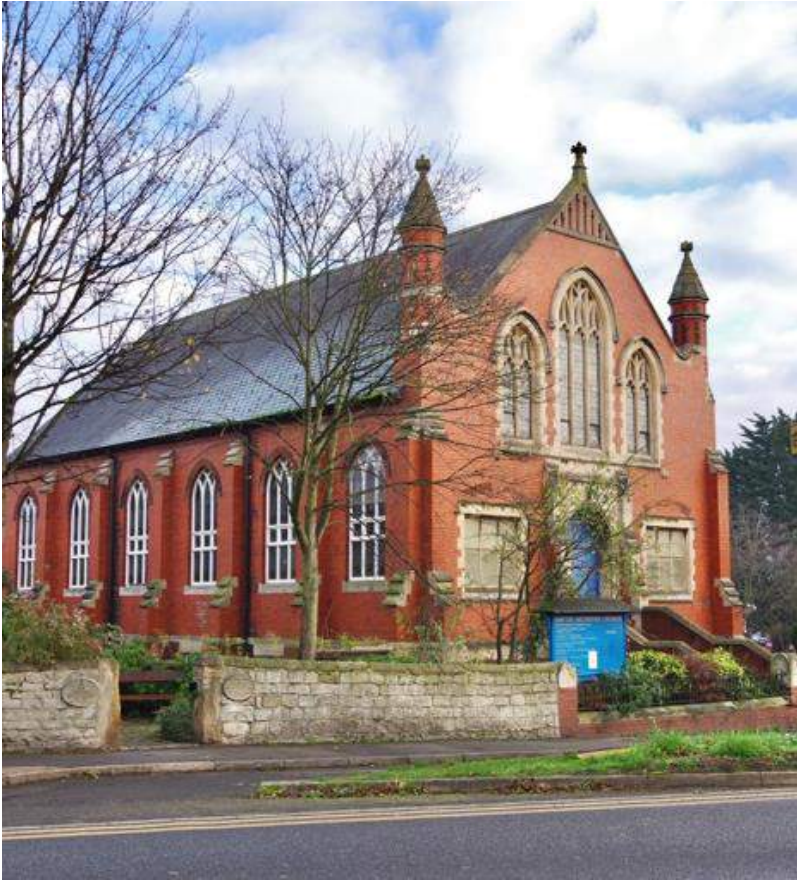
Bawtry Methodist Chapel - BHG's nomination to the South Yorks Heritage List

The group has nominated various sites for inclusion in the South Yorkshire Heritage List, which relates to the protection of sites or buildings not within the town's Conservation Area. Ida's View, the Idle Battle site, Market Hill, the Planted Town and the Wharf were all unsuccessful. The Methodist Chapel was successful and is awaiting ratification from DCC. The Roman Shrine site is under review in the next round.