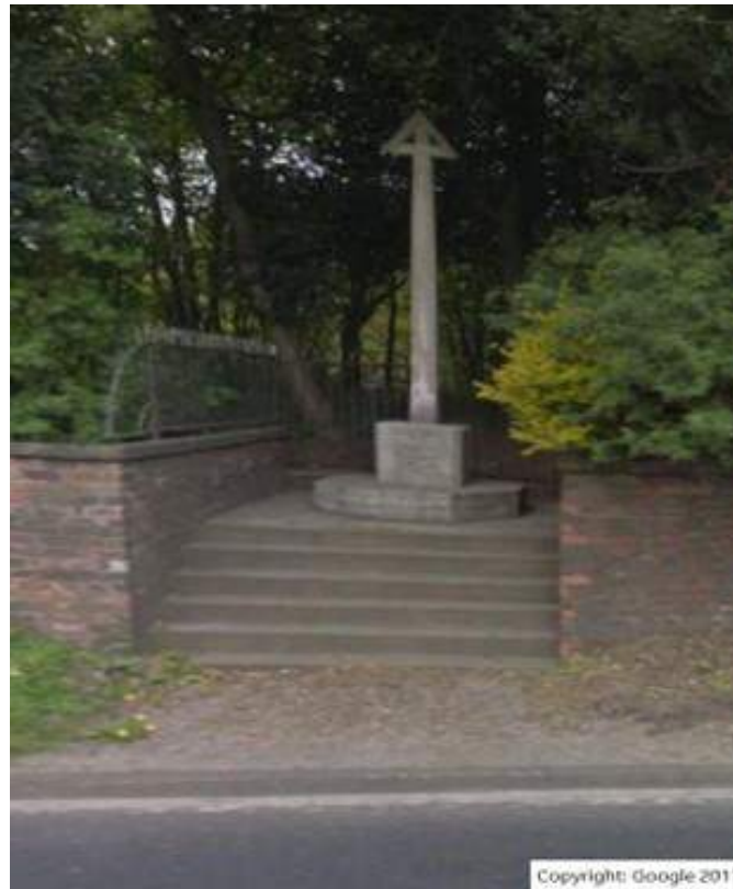
The War Memorial - before its renovation & relocation