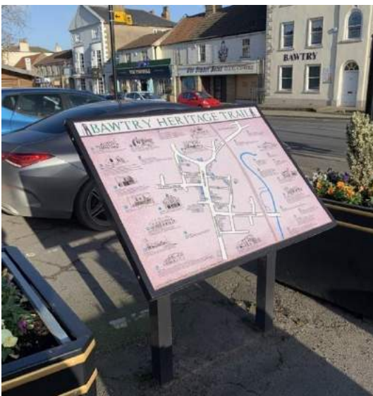
The Town Trail map lectern in the Market Place

The BHG developed its 5-year vision in a project called "Beautiful, Bygone, Bawtry" which had very ambitious and optimistic targets, but the group had little success with initial funding applications. However, the group did manage to develop the Heritage Trail leaflet and the Trail board on Market Hill with the assistance of some funding from DCC. An oral history project capturing elderly residents' memories of Bawtry was also started.