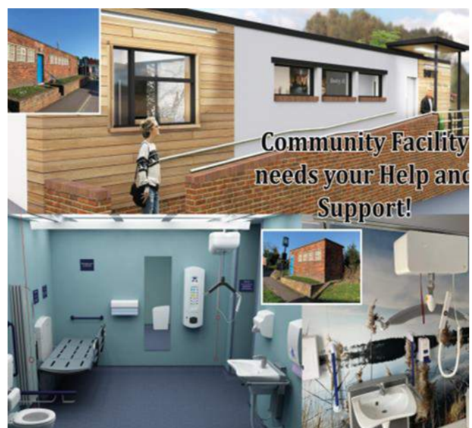
The Heritage Centre & Changing Place project