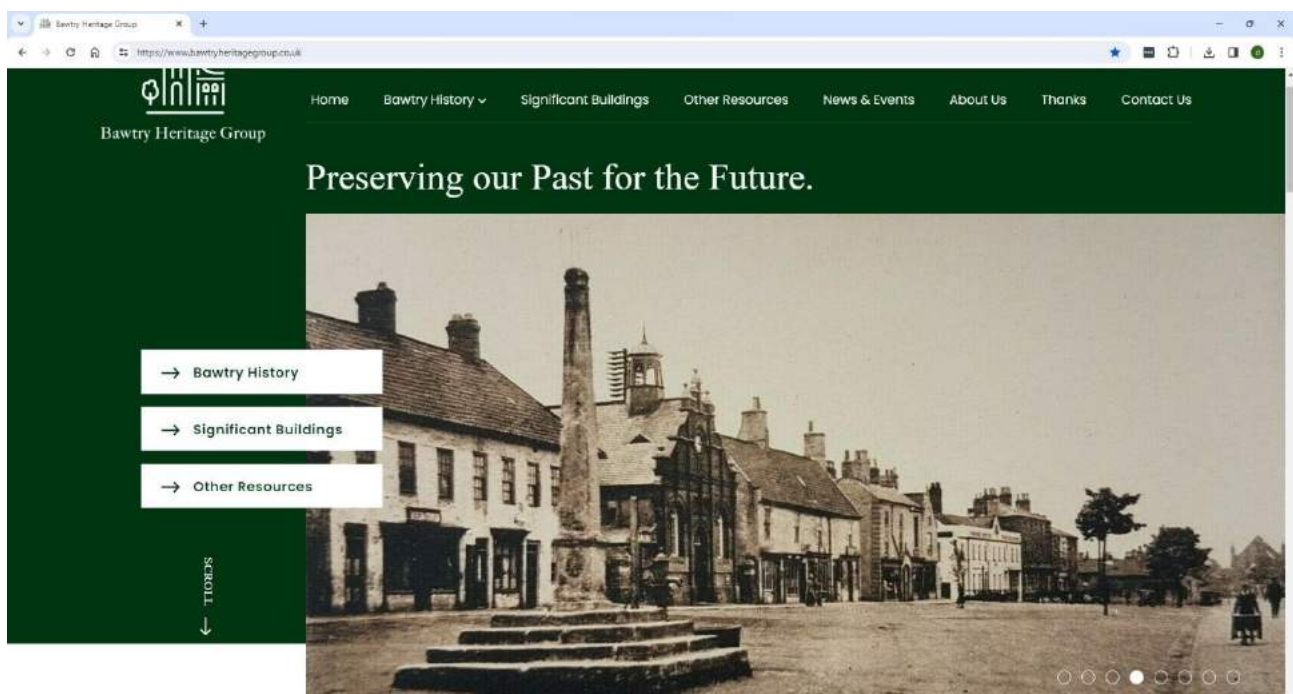
The home page of BHG's website

The website is now 'up and running' and can be found at www.bawtryheritagegroup.co.uk . It is 'a work in progress' but already contains a wealth of material, including original papers about Bawtry's history, a substantial gazetteer of historic sites and buildings, Bawtry census returns, and other material. The history papers include two on Roman Bawtry and two on Bawtry wharf, plus one each on the Pilgrim Fathers, the Battle of the River Idle, Bawtry and the 'coaching era', Ida's view, the Norman Planted Town, the Phoenix Theatre, and Bawtry Scouts 1967-1977. There is also a paper on Tall Tales/Horrid Histories.