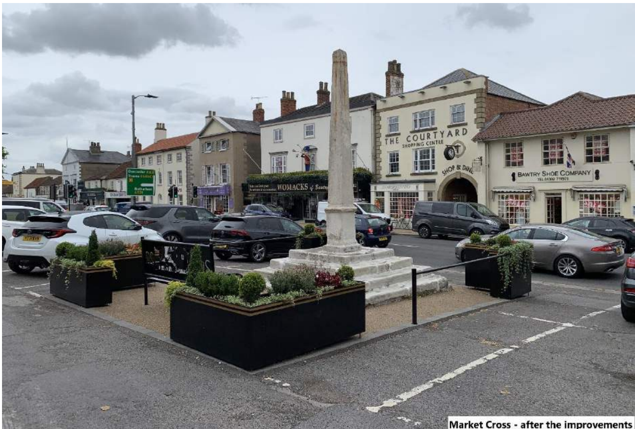
Market Cross - after the improvements

The group also started an empty shop window dressing project (providing historical information about Bawtry) during 2020.